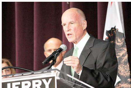
Jerry Brown, 39th Governor of California